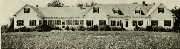
Inviting Sunny Acres, Lewisville, North Carolina